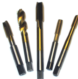
Titanium nitrided taps.

Both above processes are normally only required for Spiral point and Spiral flute taps when the work piece material requires them. These taps are known as 'Steam tempered and nitrided' and have a blue/black finish.