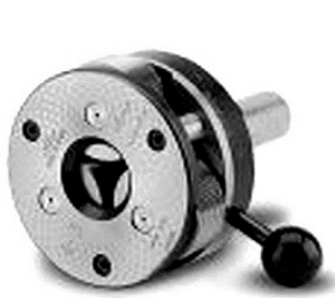
STATIONARY AXIAL HEAD