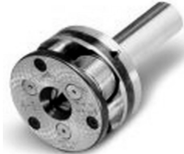
ROTARY (G) AXIAL HEAD